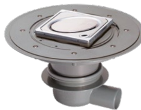
Illustration shows Art. no. 40 150.54 with Lock & Lift locking system

slotted cover 138 × 138 mm and rim made of stainless steel AISI 304, for tile thicknesses 8 – 16 mm, class L 15