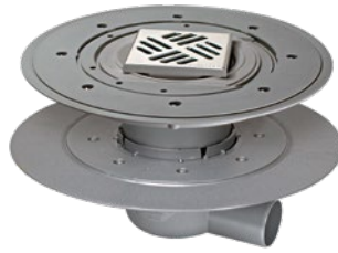
Illustration shows Art. no. 40 159.50

Slotted cover 95 × 95 mm in stainless steel AISI 304, for tile thickness 6 – 14 mm, class K 3