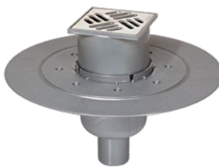
Illustration shows Art. no. 40 250.90

Slotted cover 100 × 100 mm in stainless steel AISI 304, class K 3