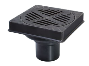
Illustration shows Art. no. 67 110B

Round slotted cover Ø 235 mm, class B 125 (12.5 to), with Lock & Lift System