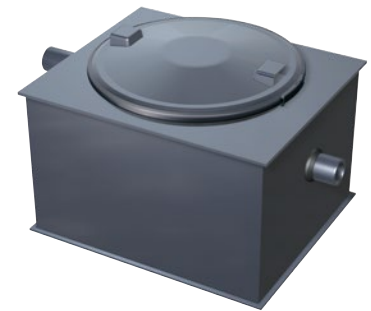
Illustration shows Art. no. 97 202/000